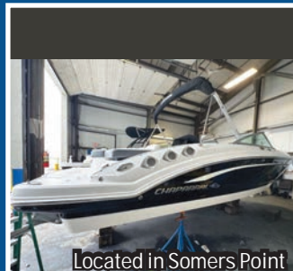
Located in Somers Point

22' '21 Sailfish 220 CC, Yamaha F200 XB • $69,900