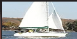
35' '87 Hunter Legend , Yanmar Dsl, elec fridge, windlass $24,900