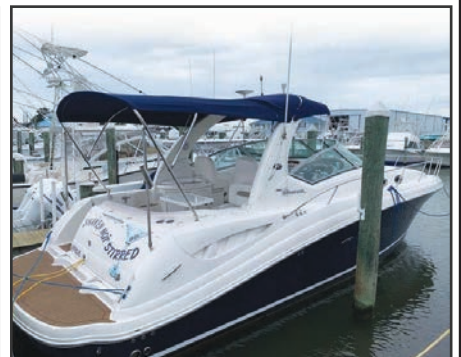
34' 2006 Sea Ray 340 Sundancer $119,000

Interested in Selling... Give Us A Call Today! 443.877.7080