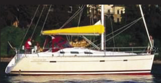
39' '03 Beneteau 393 Sloop , 2 cabin/2 head, '21 inflatable and elec motor, very nice, widow looking for offers • $124,900

Extremely low hour motor yacht that has completed an extensive total refit by Worton Creek Marina of soft goods, electronics, interior LED lighting, appliances and AC units. The interior of this yacht is stunning and has been totally redone. Exterior improvements include new flybridge, aft and foredeck cushions, helm chairs, bridge electronics, sunroof cover, etc.