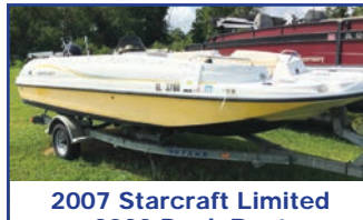
2007 Starcraft Limited 2000 Deck Boat Mercury 115 4-stroke Free Load Rite trailer Priced to Sell at $8,995