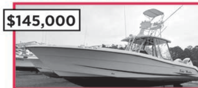
2005 HydraSports 3300CC Vector Tower - 2018 Suzuki DF350