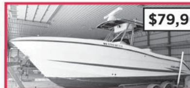
2000 HydraSports 2596CC / 2600CC Vector - 2016 Yamaha F200XCA