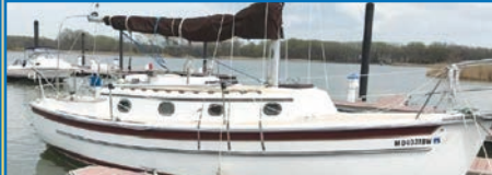
1994 Com-Pac, 16hp Yanmar Dsl, Teak & Holly sole, Sunbrella cushions, • $29,000