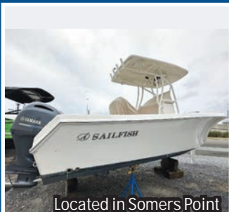
Located in Somers Point

22' '21 Sailfish 220 CC, Yamaha F200 XB • $69,900