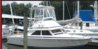
28' '86 Bertram SF , Cummins Dsls, nice elects, super clean • $49,900