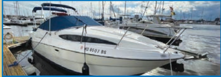
2003 Bayliner 2455 Ciera Sunbridge, Merc 5.0L. Alpha drive, extended swim platform, galley, head, Garmin nav and DF, t-tabs, shore power • $24,000

YACHT SERVICES & MANAGEMENT • CAPTAIN SERVICES • YACHT CHARTERS • YACHT SALES - USED BOATS FOR SALE -