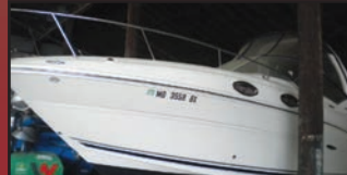
26' '06 Sea Ray Sundancer , 300hp Merc, BIII, NO AC, very nice • $34,900