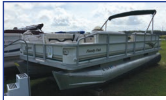
2002 Crest Family Fisherman 22, 2014 Yamaha F115 4-stroke, no trailer Price Reduced $9,999