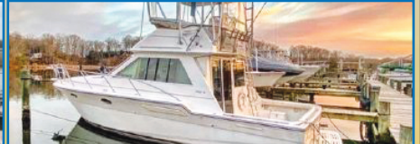
1989 Tiara Yachts 36 Conv, T/Volvo Penta 306hp Dsls, prof maint'd, gen, Eisenglass, ORs & more • $79,900