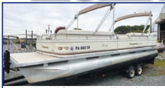
2003 PlayBuoy Tropic SE 2423, 2022 Mercury 115 Pro 4-stroke - w/warranty, free trailer Listed for Only $21,990