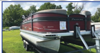
2014 Premier Gemini 221RE Evinrude 115hp E-Tec trailer additional Only $13,900