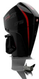
175XL ProXS 4-stroke Black