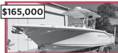
2022 Key West Boats 263 FS - Yamaha Engine, Center Console