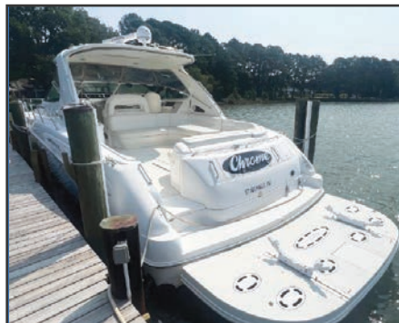
54' 2000 Sea Ray 540 Sundancer $334,000