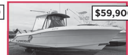
2000 HydraSports 2800CC Vector - 2007 Suzuki DF300