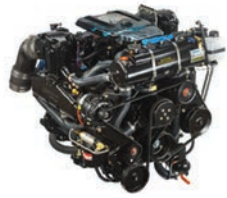
Mercuriser 383 FWC

*Call for Pricing and Details on our Used Engines!