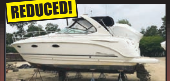
32' '02 Chaparral 320 Signature , T/5.7L Volvo, gen, AC • Offers Wanted $34,900