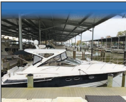
44' 2009 Regal 4460 $249,000