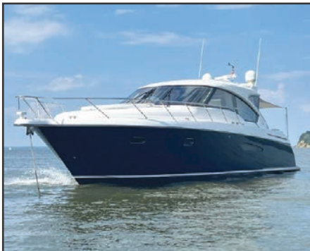
58' 2013 Tiara Yachts 5800 Sovran $849,000