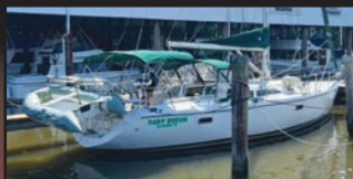
36' '97 Catalina MK II , gen, AC, bow thruster, elec gridge, dingy and davits, exc cond • $79,900