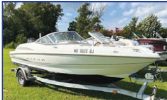
2000 Maxum Bowrider Mercury 125 ELPTO, free trailer Listed for Only $2,995