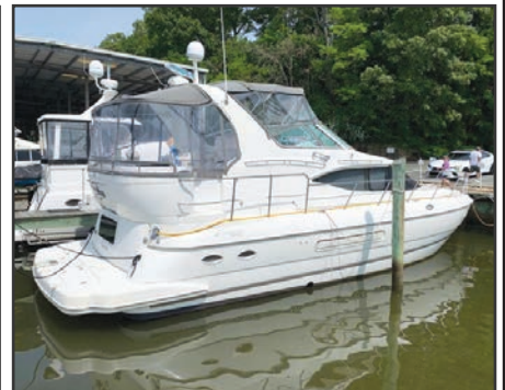
45' 2000 Cruisers Yachts 4450 Express MY • $219,000