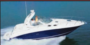
32' '05 Sea Ray Sundancer , T/320hp Mercruiser V-Drive, gen, AC • $89,900