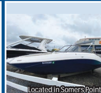
Located in Somers Point

2020 Striper 2301 WA OB Yamaha F250, lift kept • $67,900