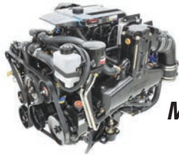
Mercuriser 350 Mag