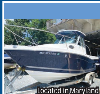
Located in Maryland

2013 Chaparral 226 SSI, 300hp Volvo, 305 hrs, rack kept • $37,900