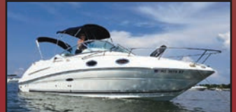
24' '07 Sea Ray Sundancer , 260hp Merc, BIII, AC, trl, very nice • $44,900