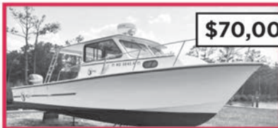
1992 C-Hawk Boats 29' Cabin - Yamaha F350 4 Stroke