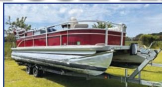
2005 Premier 225 Sunsation ES • Honda BF75A2LHTA 4-troke, free trailer Listed for Only $6,795