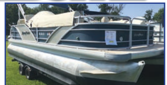
2011 Aqua Patio 220, Yamaha F150 4-stroke rebuilt powerhead w/warranty, trailer included • $25,993