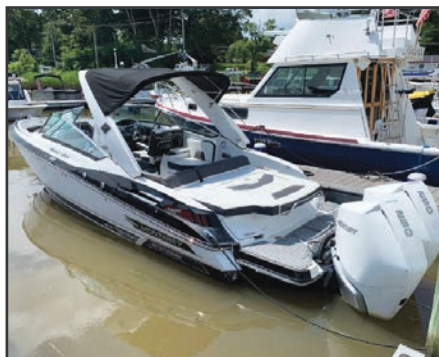
32' 2019 Monterey 305 SS $163,999