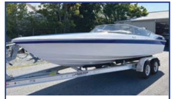
1986 Wellcraft Scarab 1 2004 Yamaha Z200 HPDI, new free Load Rite trailer Listed for Only $19,900