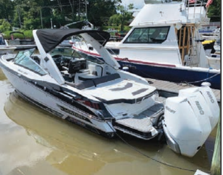
32' 2019 Monterey 305 SS $163,999