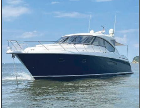
58' 2013 Tiara Yachts 5800 Sovran 54' 2000 Sea Ray 540 Sundancer $849,000