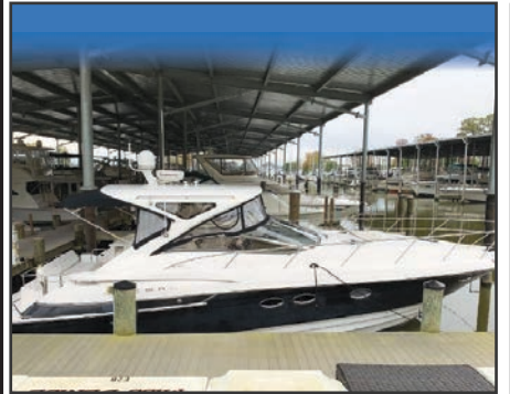
44' 2009 Regal 4460 $249,000