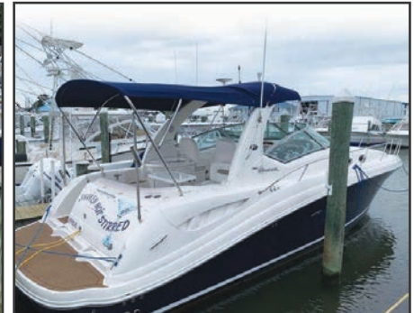
34' 2006 Sea Ray 340 Sundancer $119,000