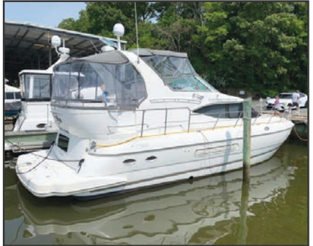
45' 2000 Cruisers Yachts 4450 Express MY • $219,000