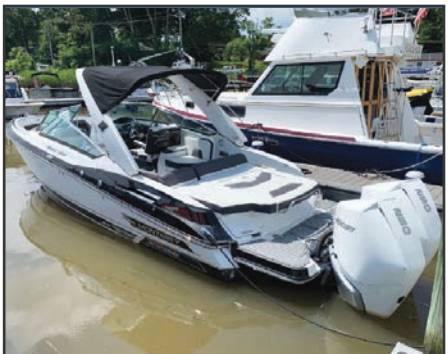
32' 2019 Monterey 305 SS $163,999