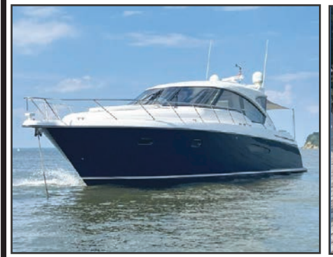
58' 2013 Tiara Yachts 5800 Sovran 54' 2000 Sea Ray 540 Sundancer $849,000