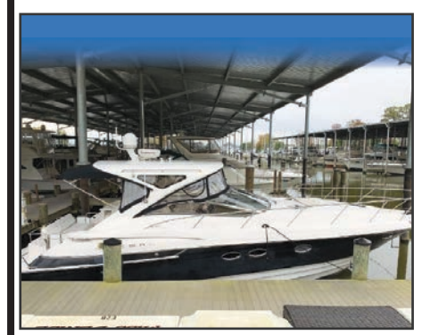
44' 2009 Regal 4460 $249,000