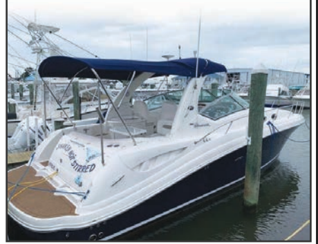
34' 2006 Sea Ray 340 Sundancer $119,000

Interested in Selling... Give Us A Call Today 3.877.7080