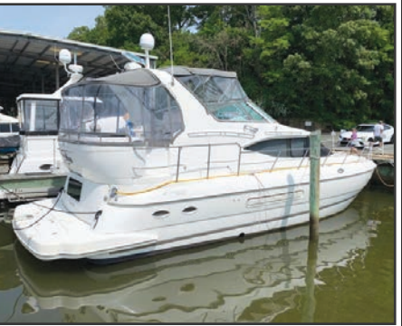
45' 2000 Cruisers Yachts 4450 Express MY • $219,000