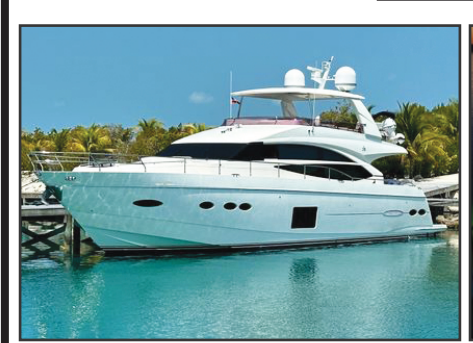
72' 2015 Princess 72 Flybridge Motors Yacht • $2,850,000