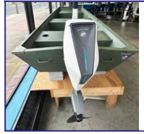
Duranautic DN1236 Duke Jon Mercury 7.5E Avator Bird Watcher Package, all electric • $5.695