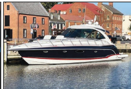
45' 2014 Formula 45 Yacht $469,000

Interested in Selling...Give Us A Call Today 443.877.7080