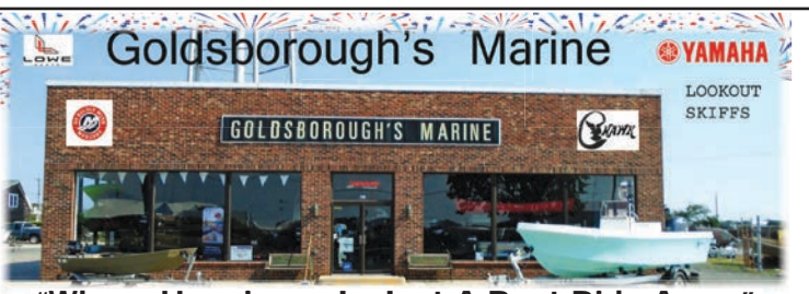
"Where Happiness Is Just A Boat Ride Away"