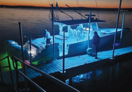
42' 2019 HCB Sietsa REDUCED $515,000